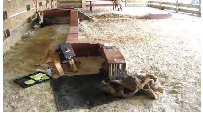
T-N-T Tunnel at 2018 Summer Celebration Trials

No entry fee. Fastest times from class 185.